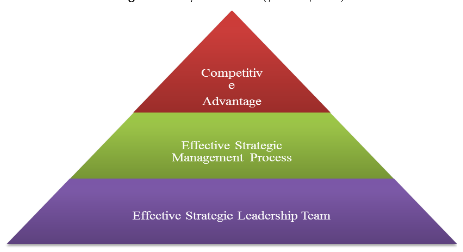
Figure 2: Competitive Advantage Model (CAM)

Based on the findings of the three key roles associated with strategic leadership in an organisation, the researchers noted that success or superior performance stems from the competitive advantage of an organisation. This situation results from an effective strategic management process. It is from an effective strategic leadership team that a successful management process is directed. Therefore, the researchers developed a Competitive Advantage Model (CAM) as depicted below: